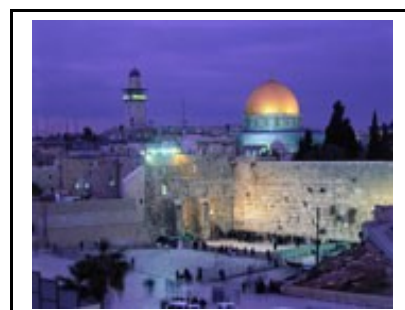
The Wailing Wall

Please note that your Passport must be valid for at least 6 months after the tour has ended.