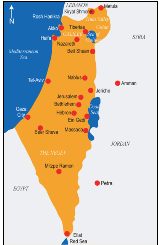
Map of Israel